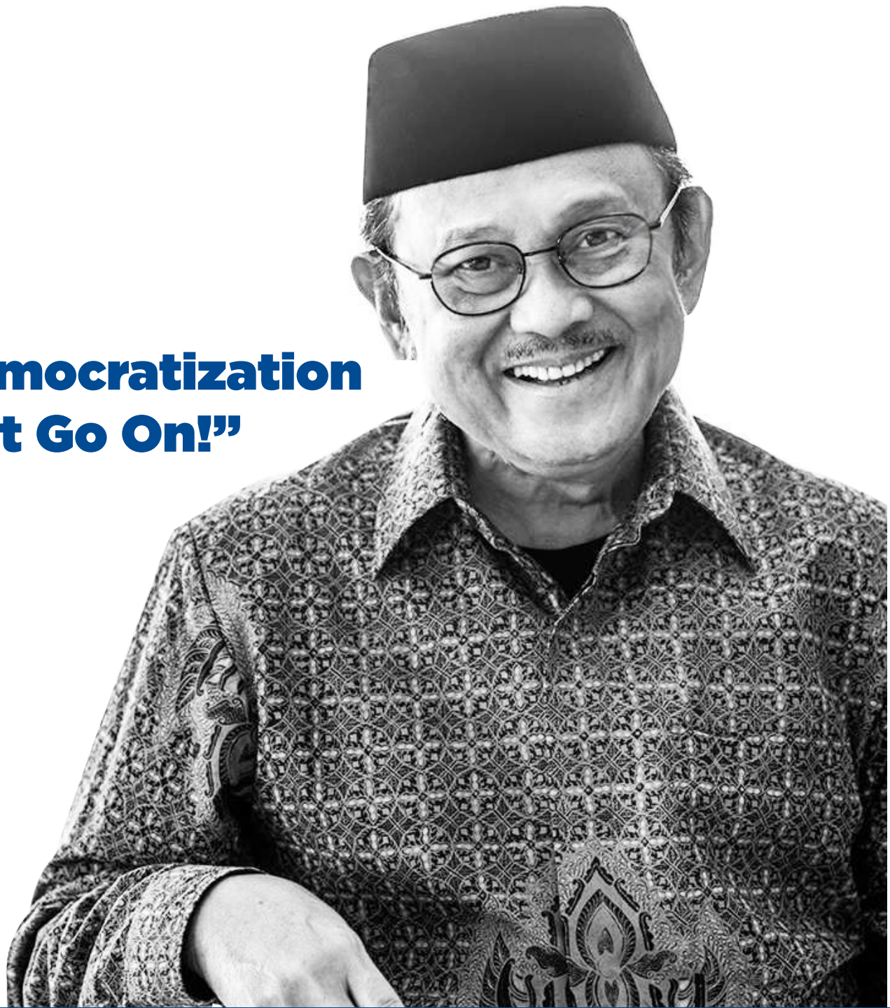
Prof. Dr. -Ing. Bacharuddin Jusuf Habibie