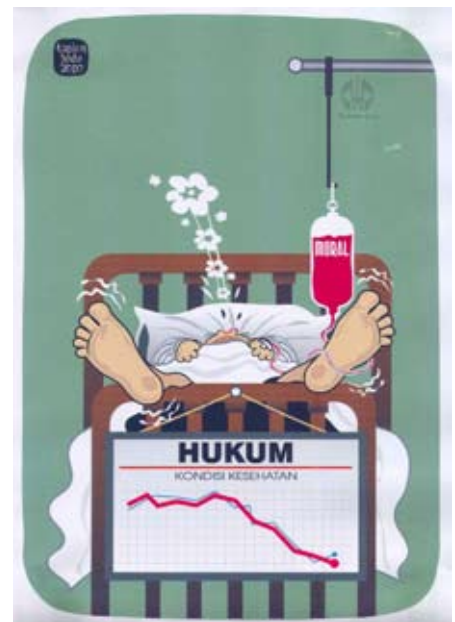
1st winner's artwork of Cartoon Competition

Indonesia failed on its promise to tackle corruption in the post-reformation era because it was not serious about handling its many unresolved graft cases. He said that although Indonesia's Corruption Eradication Commission (KPK) is at present dedicated to eradicating corruption, it is constantly under attack. As such, his advice was "to have a total reform within the law enforcement institutions through education and preventive measures, to minimize easy bail and to give harsh sentences towards corruptors, to strengthen watchdog institutions; to reinforce the KPK, and to form independent investigations."