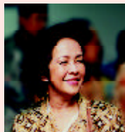
dr. Hasri Ainun Habibie