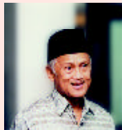
Prof. Dr.-Ing. Bacharuddin Jusuf Habibie